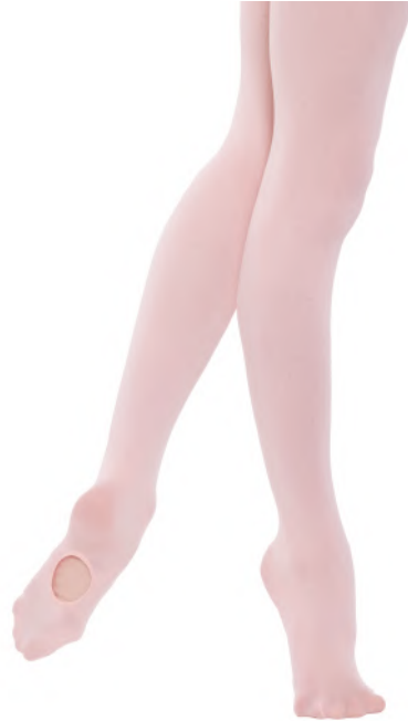
CONVERTIBLE BALLET TIGHTS

COMPOSITION: 88% POLYAMIDE, 12% ELASTANE